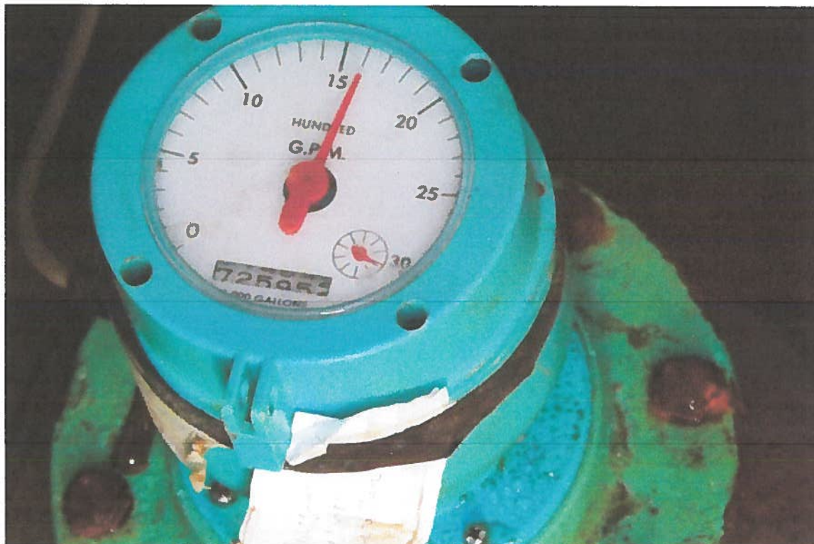
City of Salmon Water Meter

Several changes of ownership have been relayed to me by IDWR. Copies of these changes are included in this report.