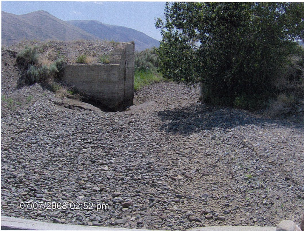
South Channel of Antelope Creek @ UC Check structure – 7/7/08