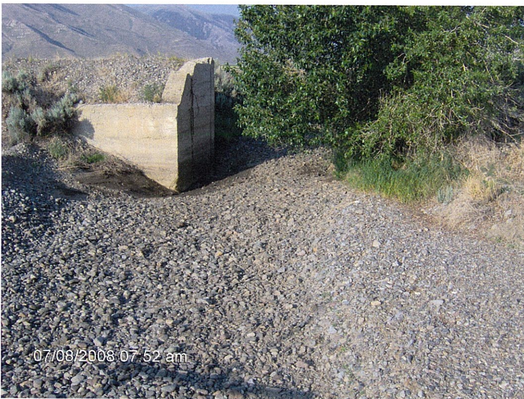
South Channel of Antelope Creek @ UC Check structure – 7/8/08