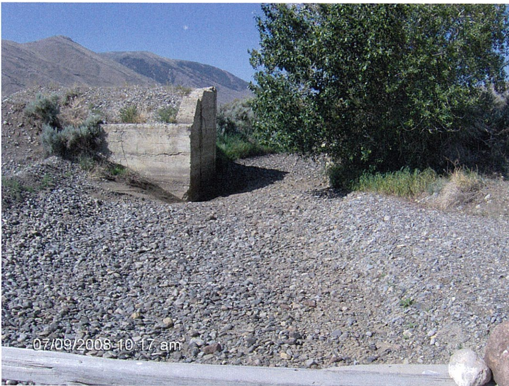
South Channel of Antelope Creek @ UC Check structure – 7/9/08