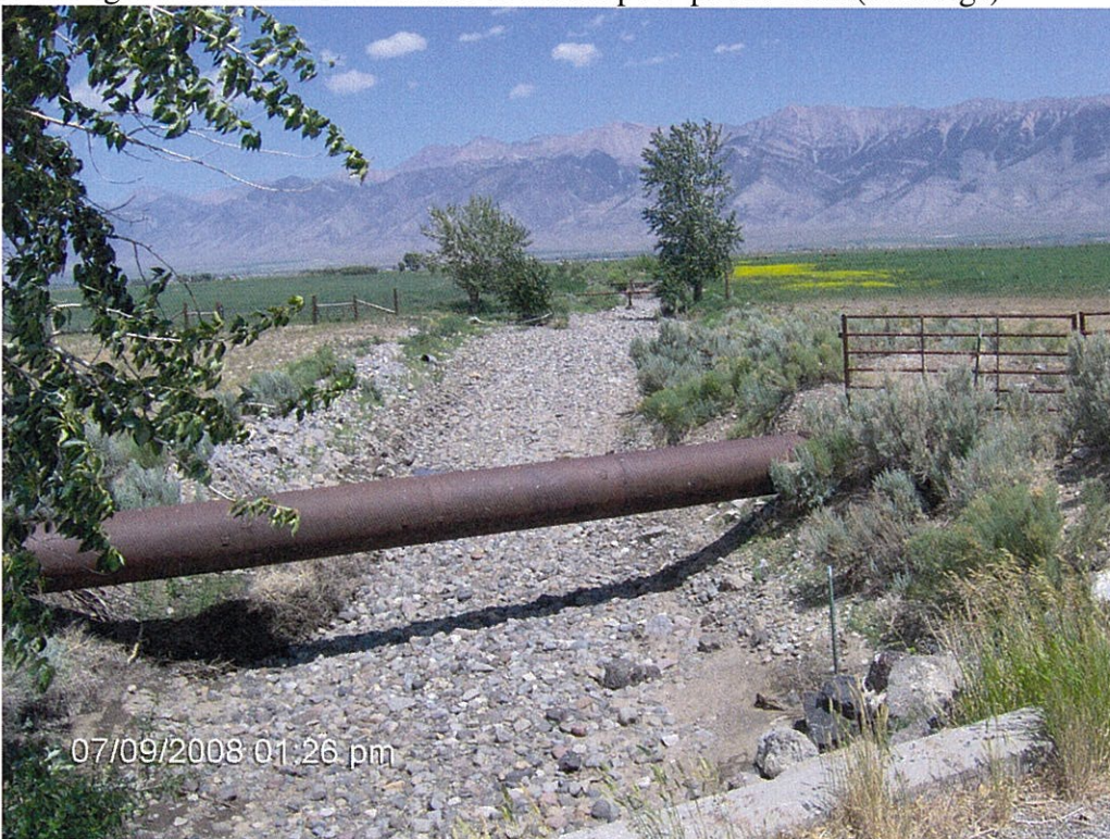
Looking upstream N. Channel of Antelope@ paved Road(Solbergs)