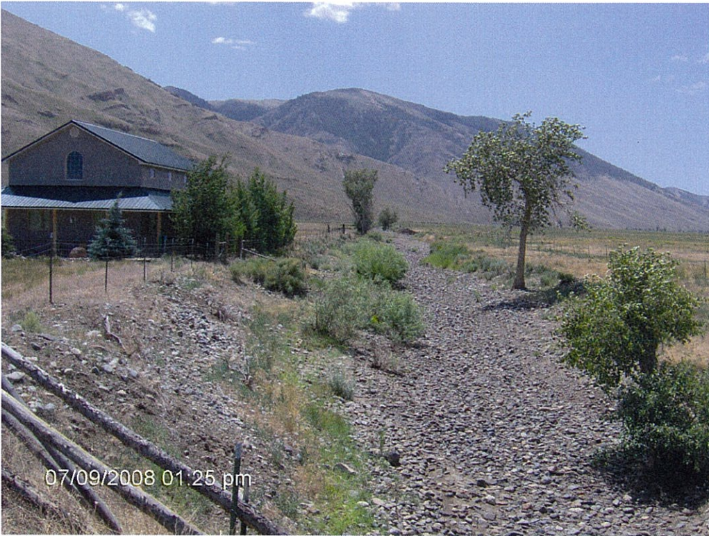
Looking down stream N. Channel of Antelope@ paved Road(Solbergs)