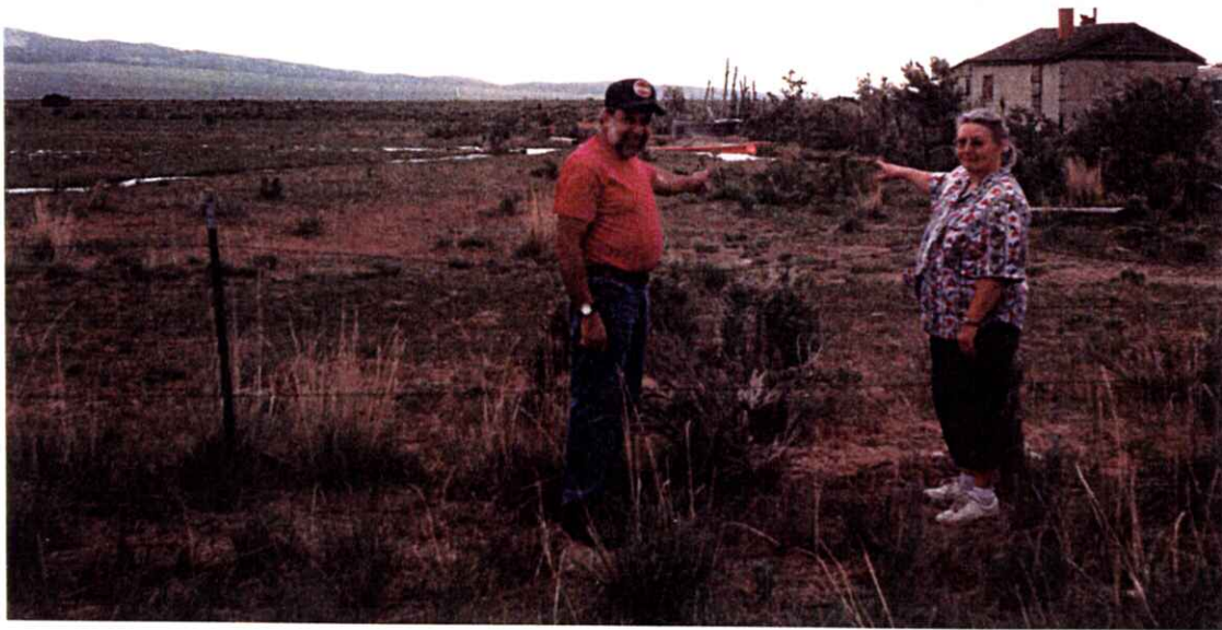
MAY 26 2001 WATER FROM TOP PHOTO RUNNING ON SE \frac{1}{4} SE \frac{1}{4} SECTION 26 IN IDAHO CAMPBELL GROUND