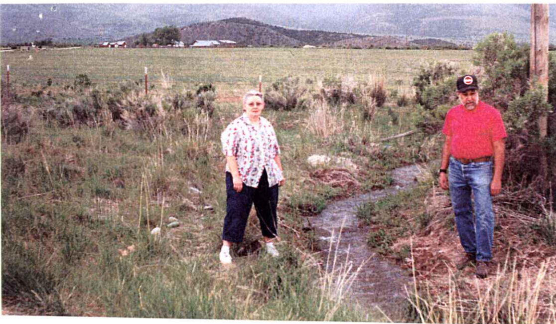
MAY 26 2001 WATER RUNNING OFF FROM LOT 1 SEC 25 25 KEMPTON GROUND