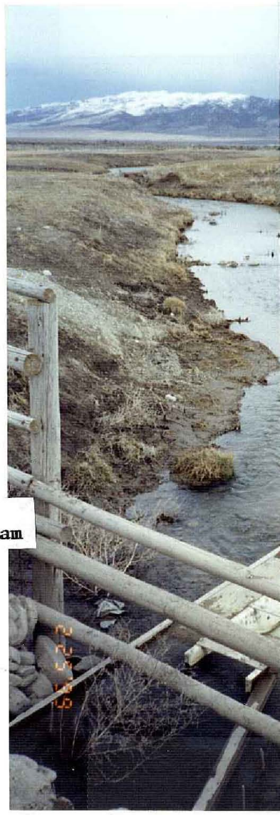
looking NE'ly, downstream

Photos are combined with 19 Feb 99 memo.