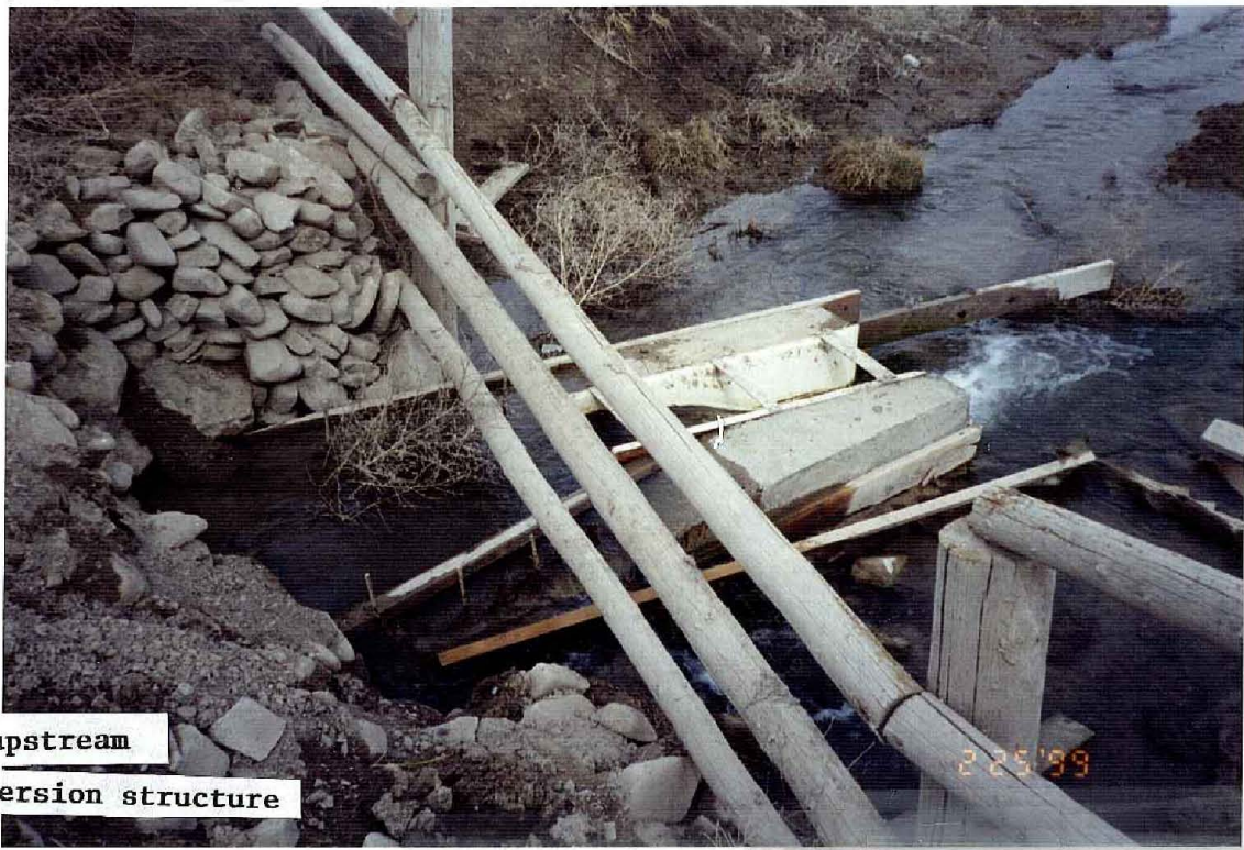
upstream diversion structure