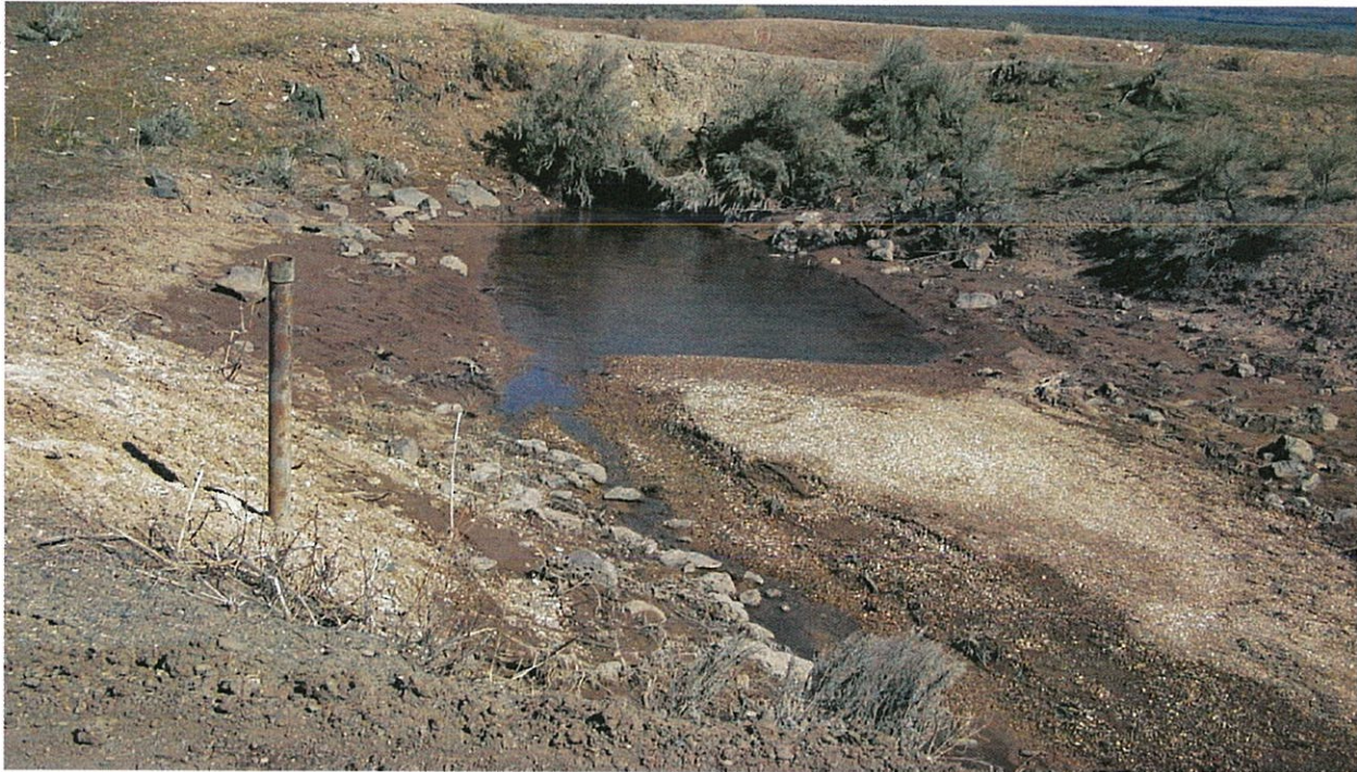
Photo #1: Batruel diversion ditch to reservoir at the Trail canal crossing, turned off