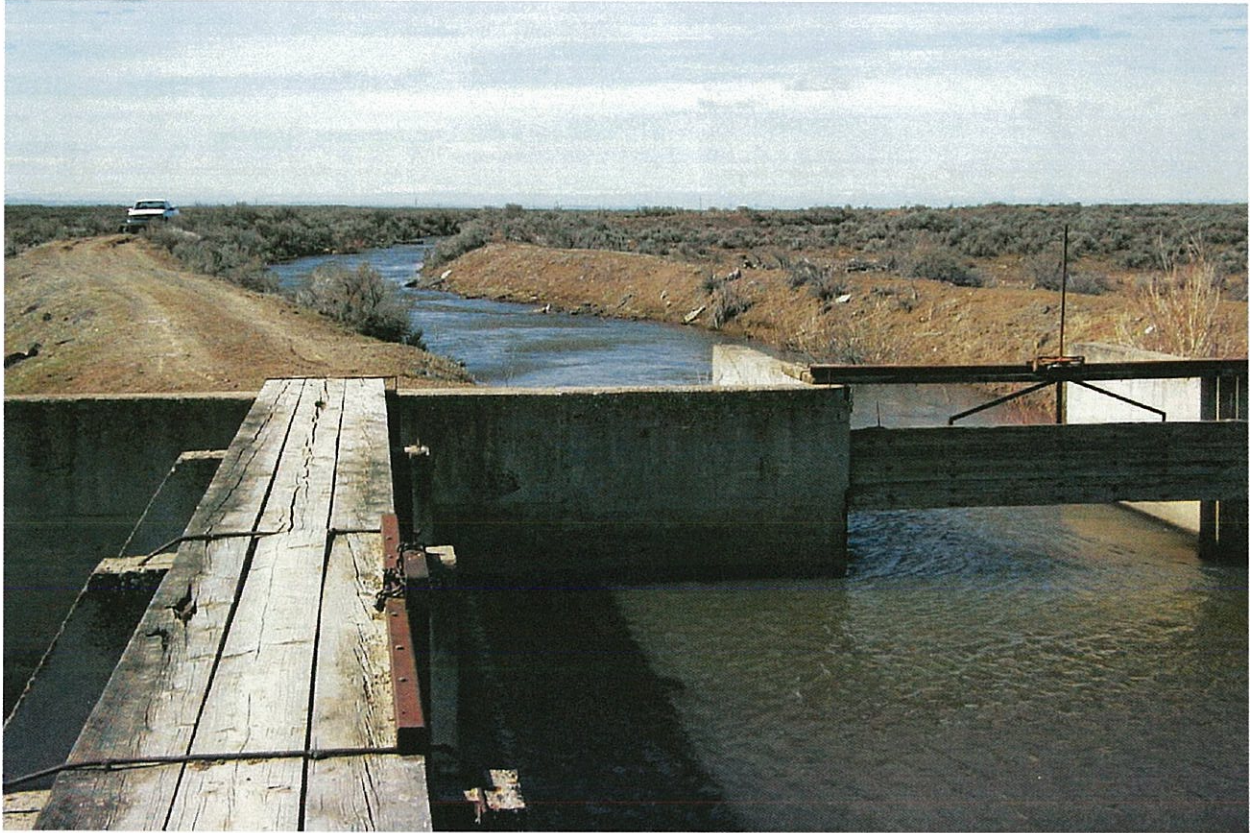
Photo #3: Little Canyon Creek Diversion to Trail Reservoir, canal near max flow.