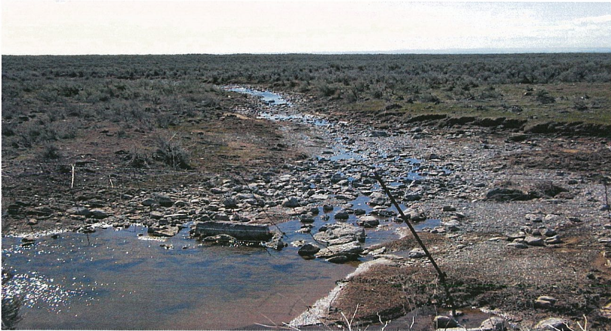
Photo #2: Diversion ditch looking south from the road at the Trail Canal crossing.