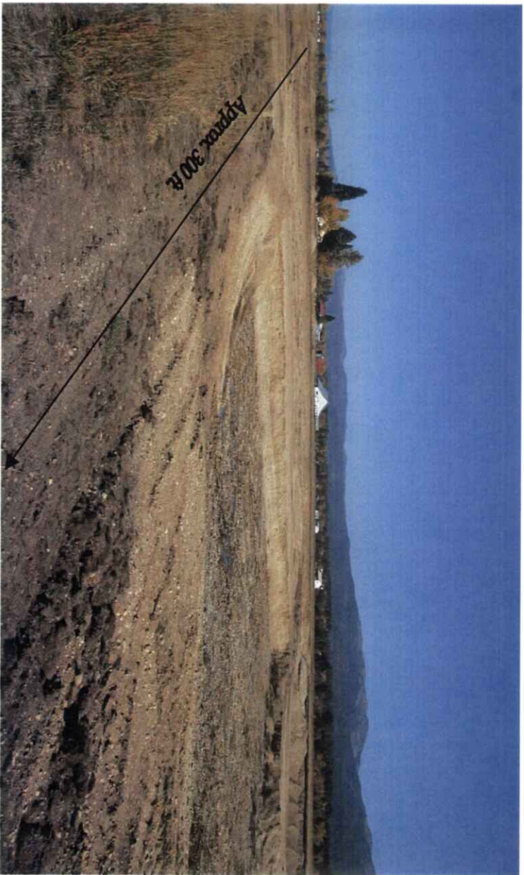
Photo #1: Pit from the southwest corner, The southwest ¼ is approx. 5 ft deep.