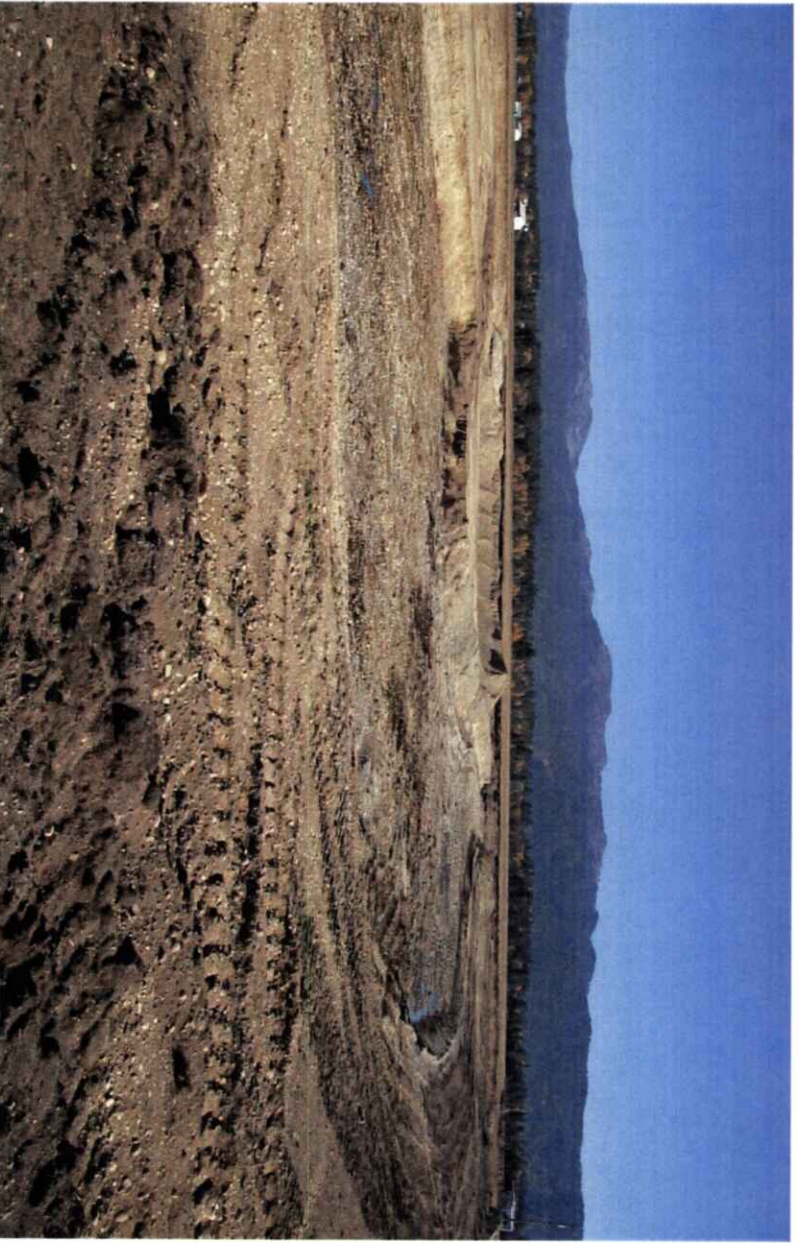
Photo #2: South ½ of the pit, some standing water along the edges, cobble rock along bottom.