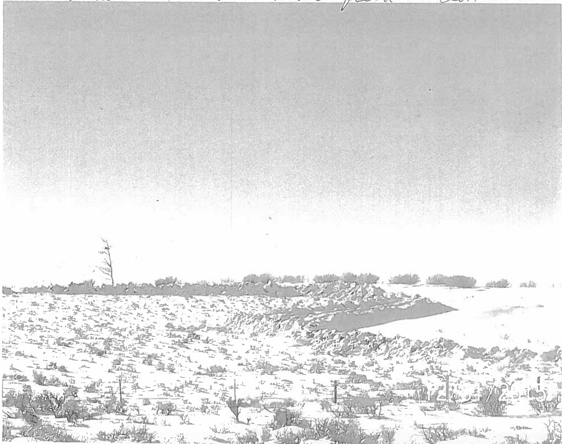
Devil Creek Ranch - lower field 2016