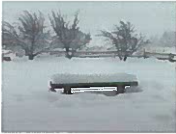
Winter IN ALBION 2017