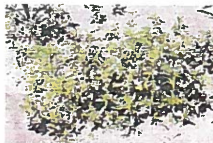
Picture Sample of Water Speedwell