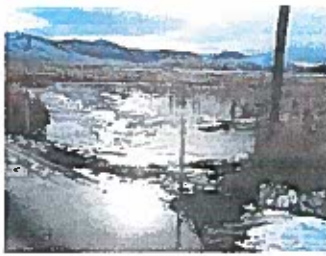
February 10, 2017 @ 1250 East Marsh Creek Bridge