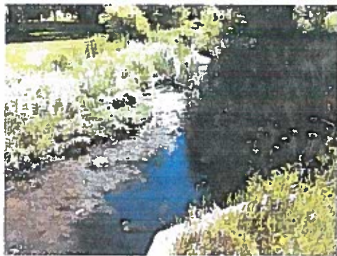
Off of 1050 East "Land Creek" 12 foot weir Note: The closure on both sides of creek approximately 14 feet down from weir.

Water speedwell is an emergent biennial or perennial to 3 ft tall, with glabrous opposite leaves. Plants typically develop a system of rhizomes and/or stolons. The stems are erect to spreading, sometimes creeping and often rooting at lower nodes. The leaves are usually sessile and 1 to 4 inches long with a smooth to serrate margin.