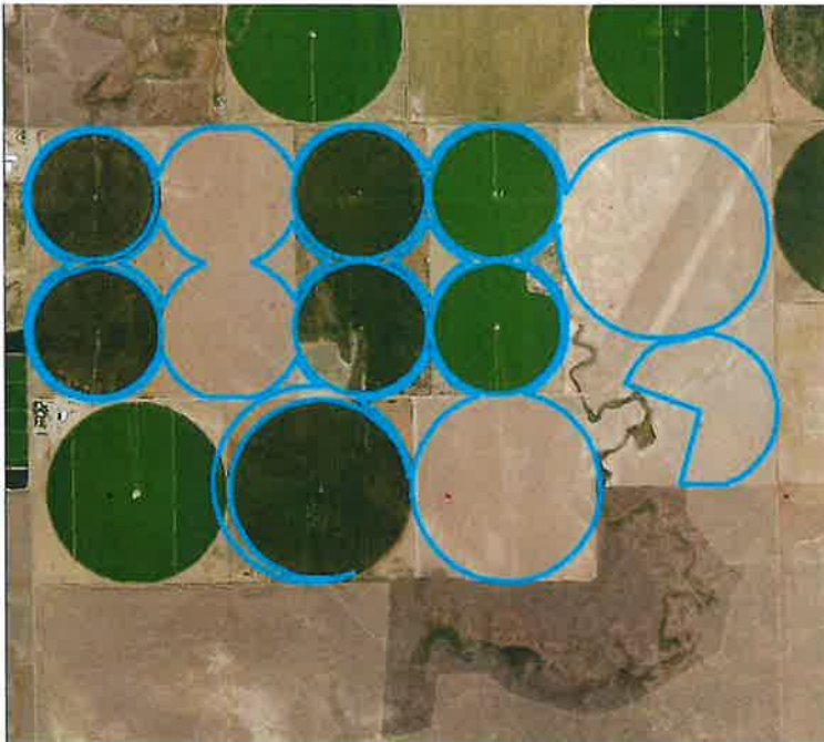
Figure 1. 2023 Aerial Imagery and the place of use for Lease Application 2909.

The point of diversion is within basin 17. The Eastern Regional Manager was contacted for comment on March 21 st , 2024. No response was received, it is assumed there are no concerns with the applicant's proposal.