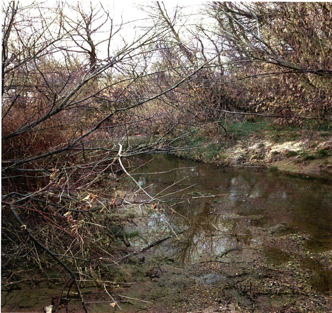
Photo #1: Creek channel just upstream of the county road bridge. There appears to be little additional flow since the start of spring runoff from bank markings. Snow Pack 51% of normal on 03/24.