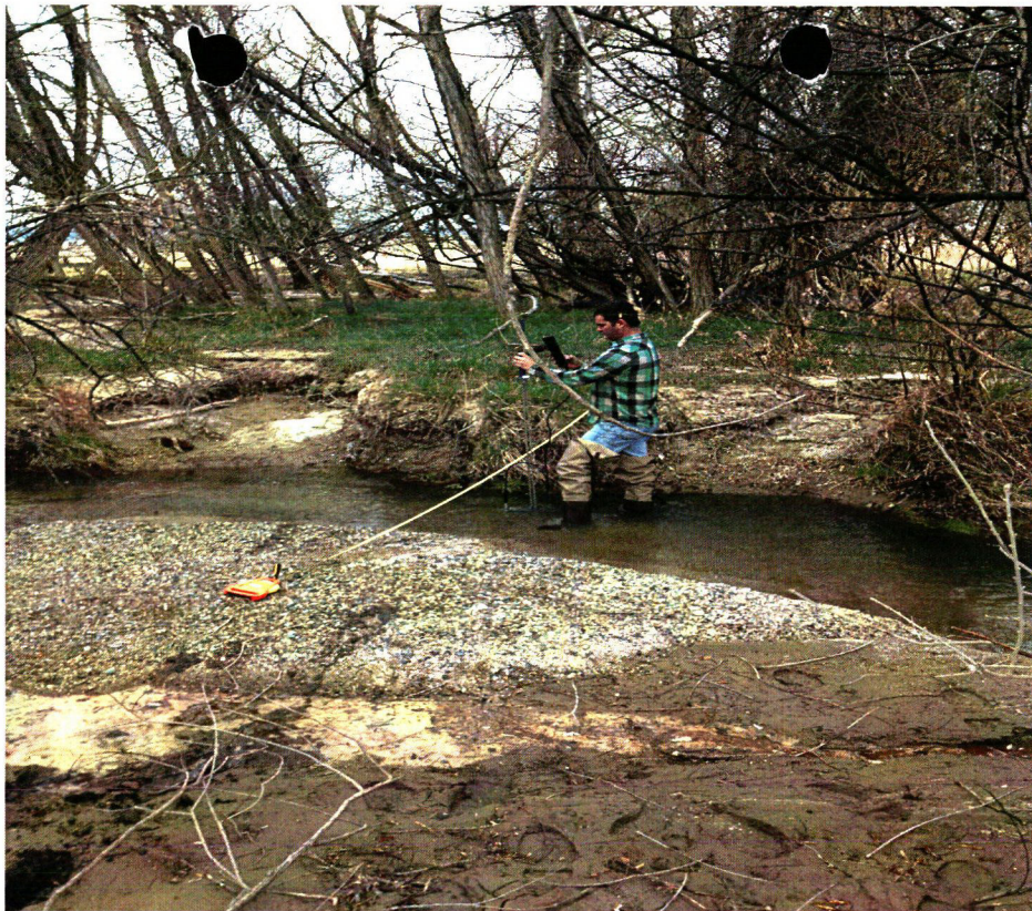
Photo #2: Measurement of creek flow just upstream from the county road bridge. Flow 1.9 cfs.