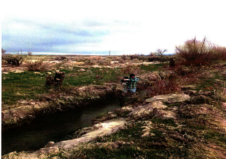
Fuquay ditch, flow 1.2 cfs