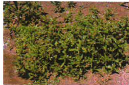
Picture Sample of Water Speedwell

VERONICA ANAGALLIS AQUATIC L, COMMON NAME "WATER SPEEDWELL". CASSIA COUNTY WEED -ABATEMENT INDICATED THAT RODEO WILL TAKE IT OUT. THIS WEED HAS BEEN MISTAKEN AS NIGHT SHADE BY SOME. IT IS THROUGHOUT ALL CREEK CHANNELS, DELIVERY DITCHES WITHIN THE ALBION VALLEY AND ALSO THE RESERVOIRS. THIS WEED IS IN THE PROCESS OF CHOCKING OFF THE CHANNELS.