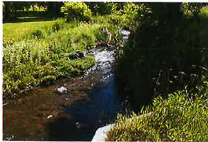
Off of 1050 East "Land Creek" 12 foot weir Note: The closeur on both sides of creek approximately 14 feet down from weir.

Water speedwell is an emergent biennial or perennial to 3 ft tall, with glabrous opposite leaves. Plants typically develop a system of rhizomes and/or stolons. The stems are erect to spreading, sometimes creeping and often rooting at lower nodes. The leaves are usually sessile and 1 to 4 inches long with a smooth to serrate margin.