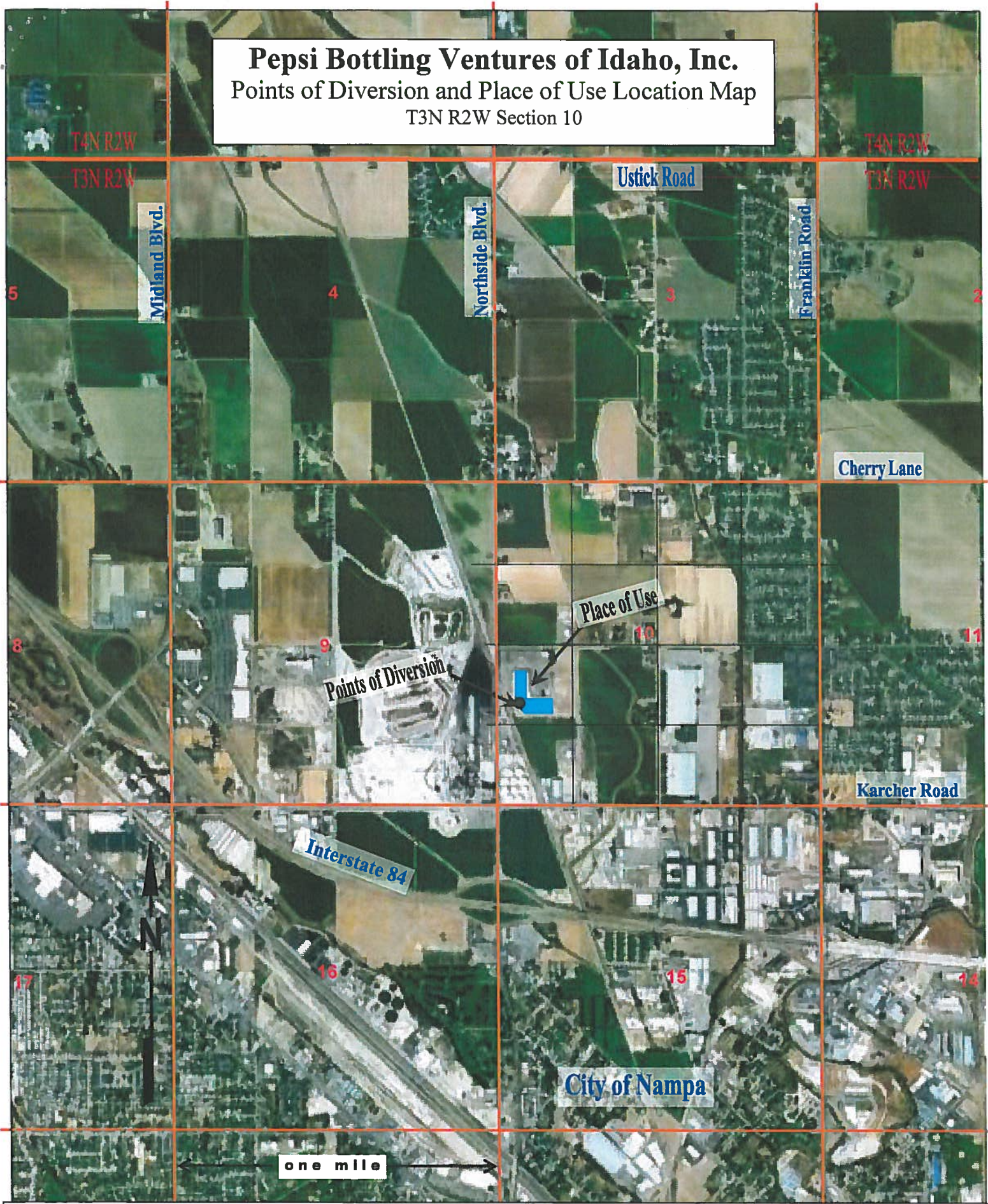
Figure 2. Aerial image for Pepsi Bottling Ventures of Idaho, Inc. Points of Diversion and Place of Use, both found inside T3N, R2W, Section 10, NW ¼ of SW ¼. Image is from Google Earth and is dated 9-11-2011.