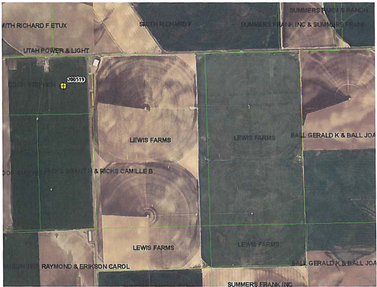
Land ownership from IDWR records shows area owned by Lewis Farms.