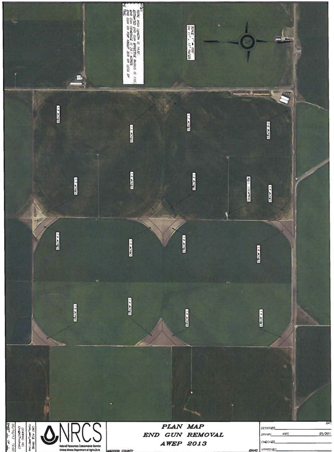
AWEP proposal map for Jeff Raybould project.