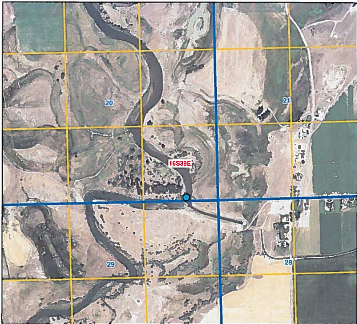
2013 Aerial Photo