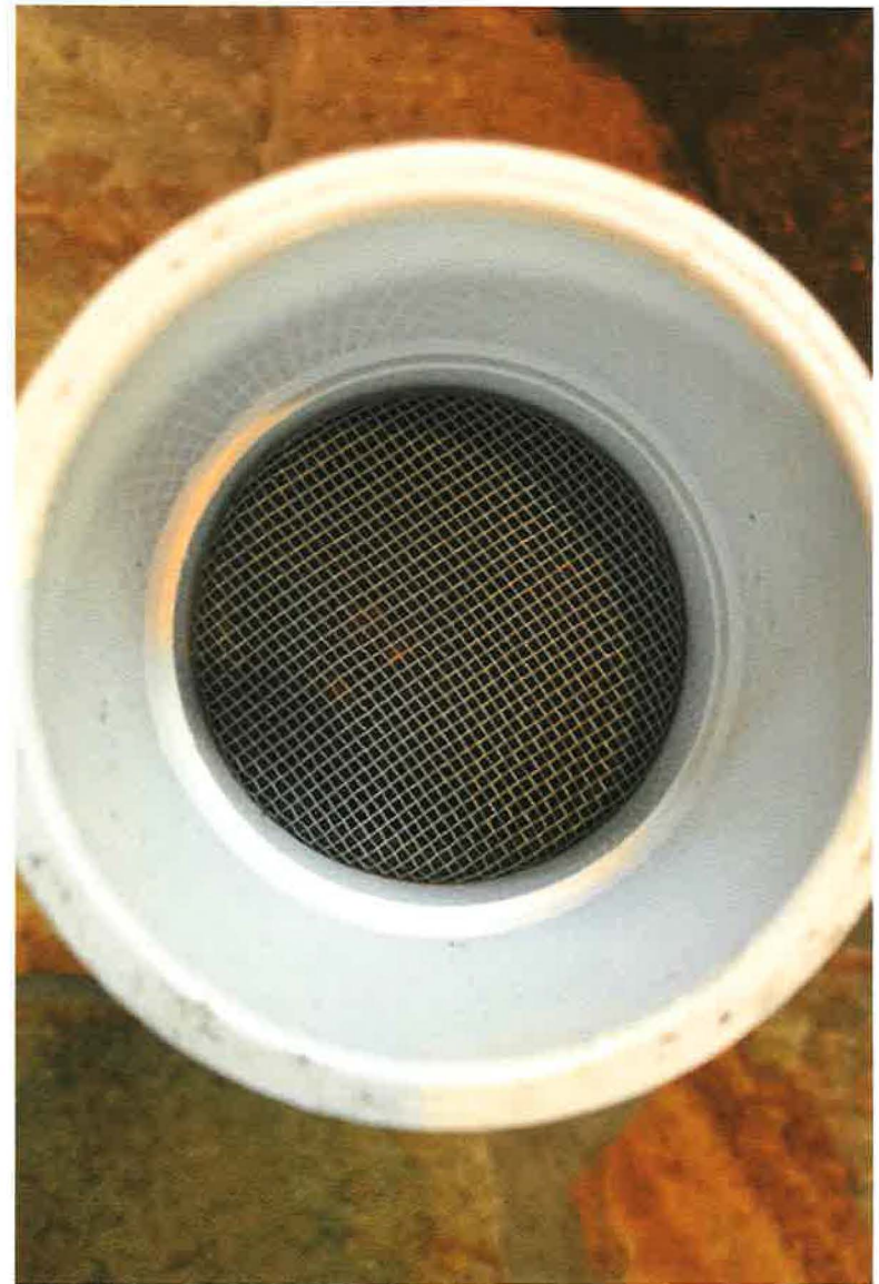
Screen to prevent fish from entering