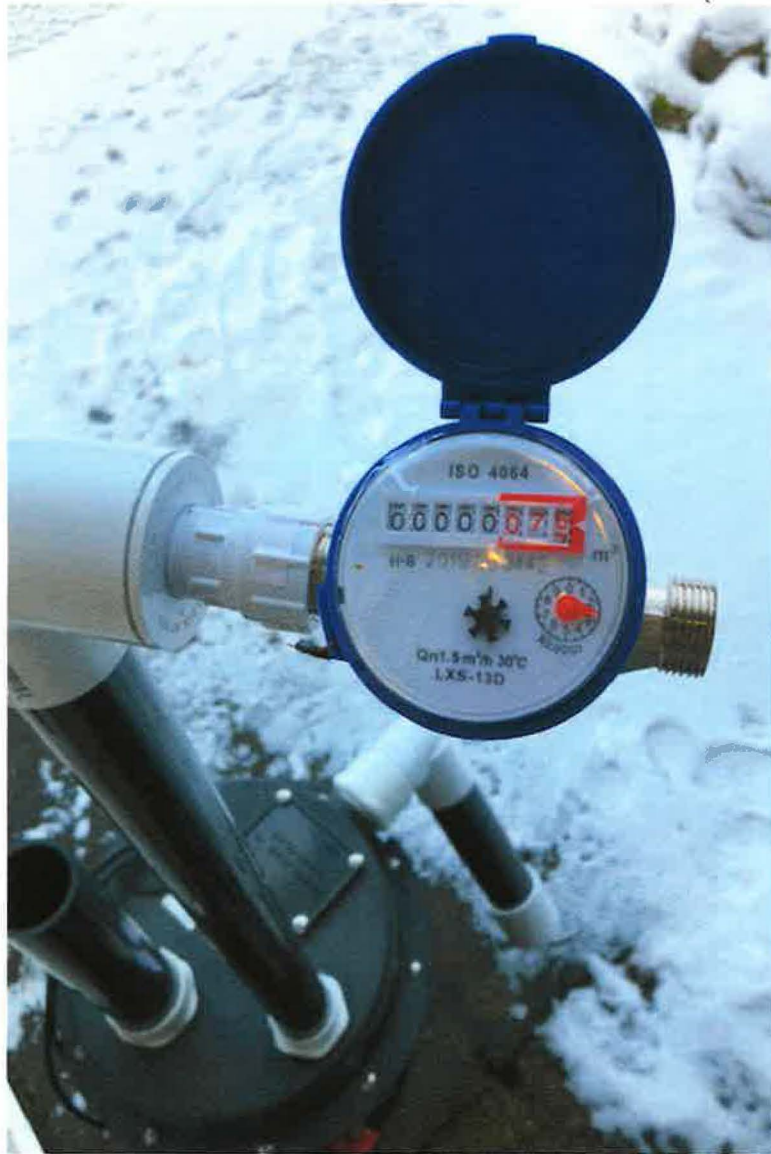
Garden hose attaches here Sprinkler attaches to the hose.