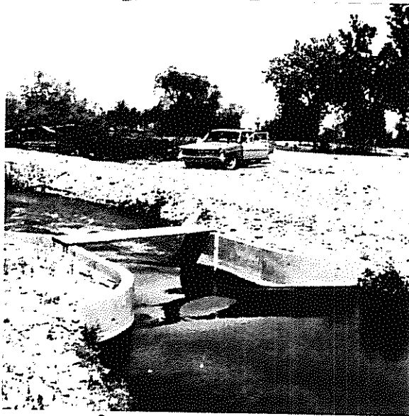
8' current meter station

The Island High Line Canal has an 8 foot current meter station, and is located one mile south and one half mile east of Parma.