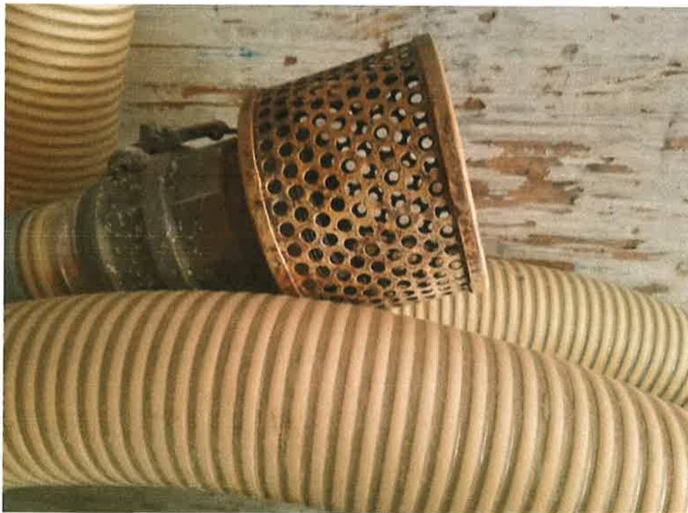
FISH SCREEN AT PUMP INTAKE