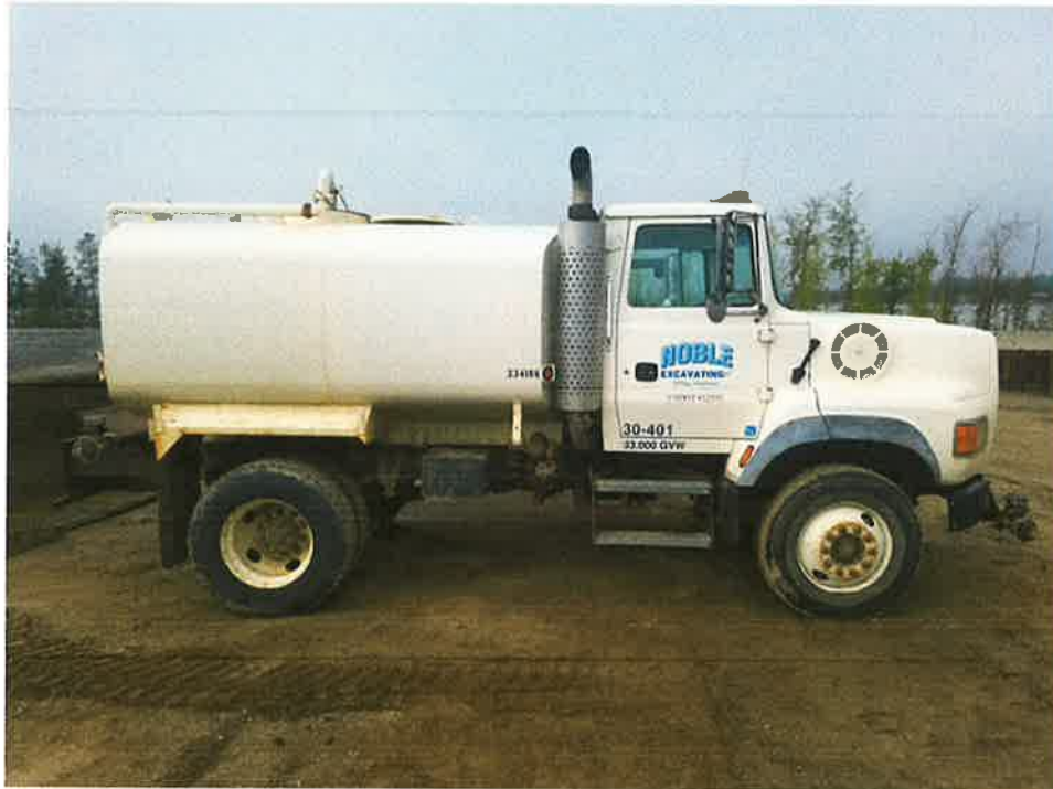
WATER TRUCK WITH 2400 GALLON CAPACITY TANK