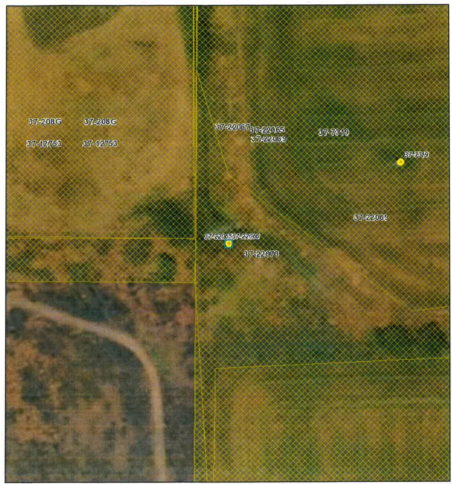
4/29/2020, 12:17:54 PM