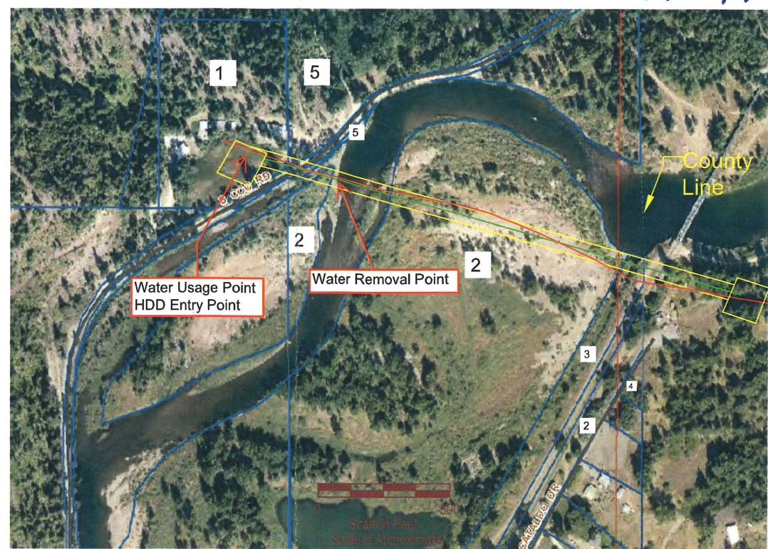
Kootenai County Property Aerial