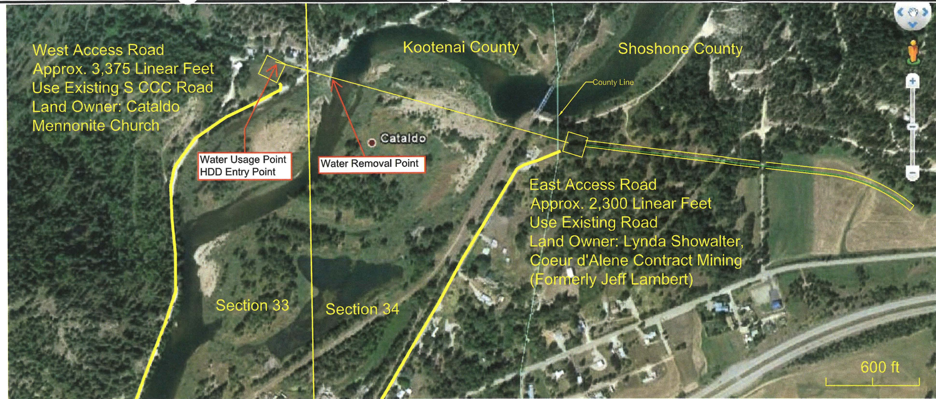
Aerial Image Courtesy Google Earth