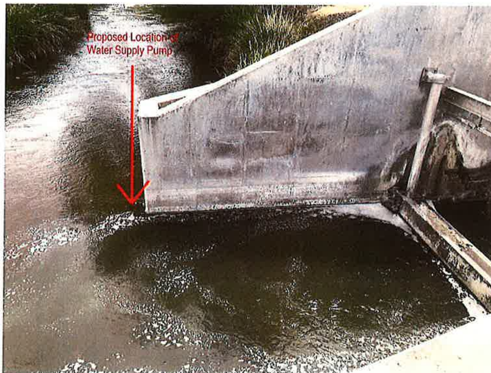
Figure 2. Proposed location of Water Supply Pump in Indian Creek at Outfall.