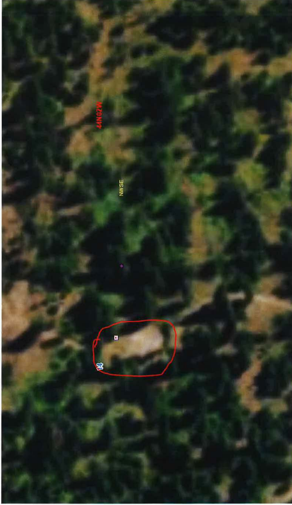
ArcMap shows where they dug up the spring.