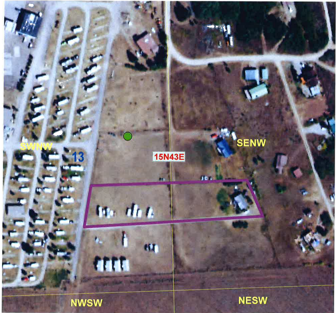
2019 Aerial Photo