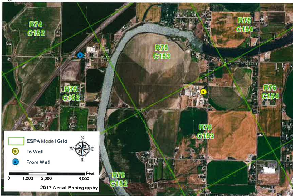
Figure 1. Well Location on ESPA Model Grid

Model grid cells are adjacent, thus no modeling is required .