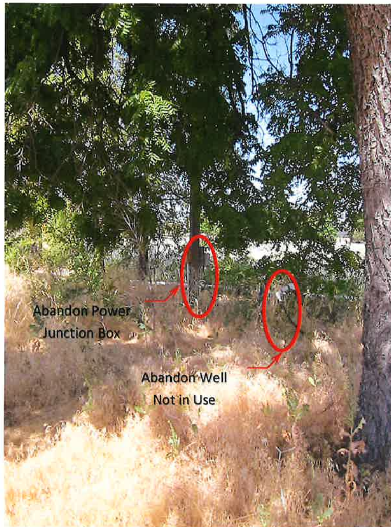
Picture 1 Well Drilled in July 20, 1992 for Irrigation Purposes