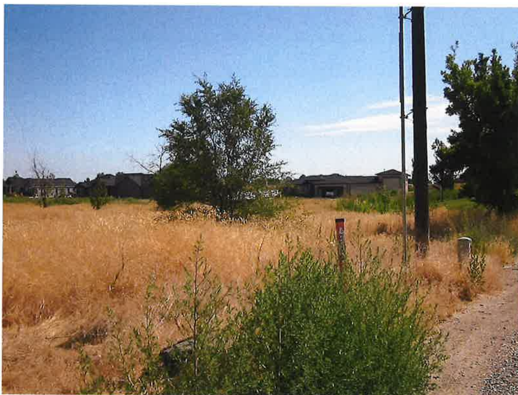
Picture 3 Place of Use Adjacent to Sub-Division