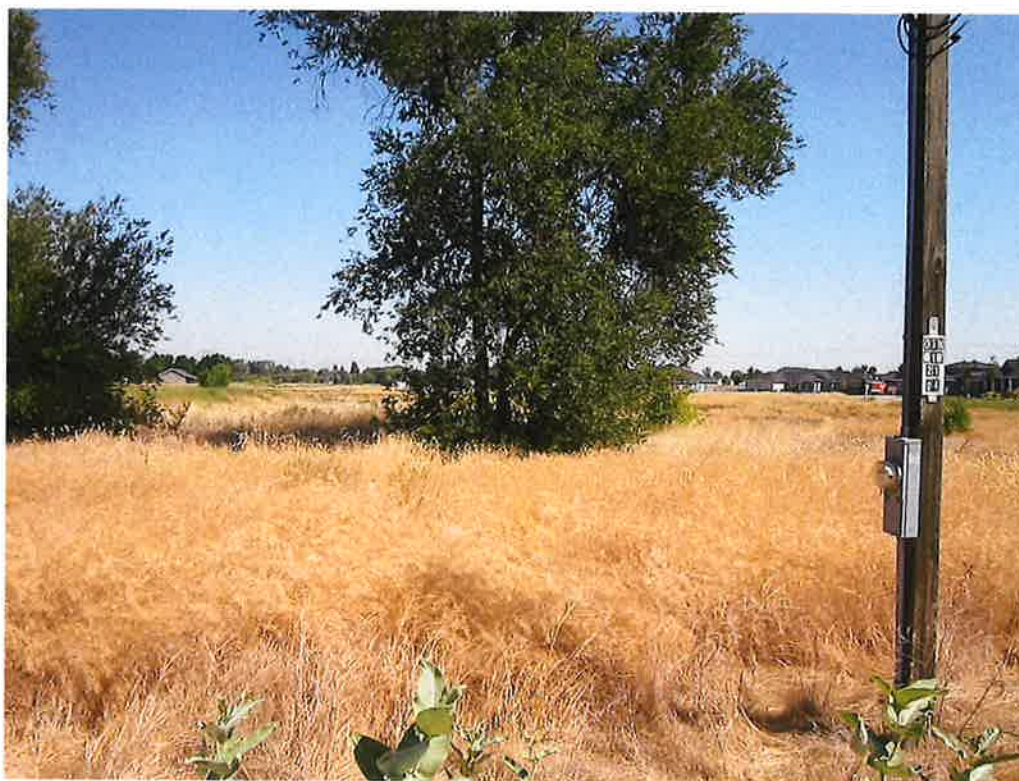
Picture 2 Place of Use Covered in Weeds